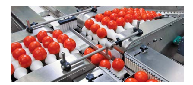
ACS180 drives are ideal for the food and beverage industry.

ACS180 drives support sensorless vector control with induction and permanent magnet motors. Customized functions with adaptive and sequence programming are possible. The ACS180 drive is part of the ABB all-compatible drives portfolio, all with the same user interface and PC tools.