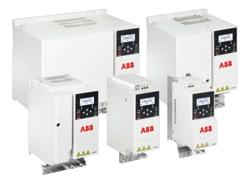
ABB machinery drives ACS180, 0.25 to 22 kW

The ACS180 is an all-compatible ABB machinery drive ideal for compact machines. This cost-effective and compact drive is optimized for machine builders requiring ease of use and reliable machine performance.